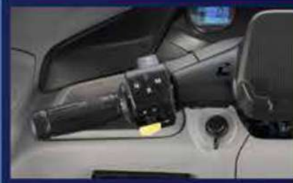
Multiple Drive Modes (Eco, Power, Climb & Park Assist)