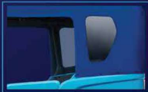
Side Visibility Window