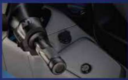
USB type A charger