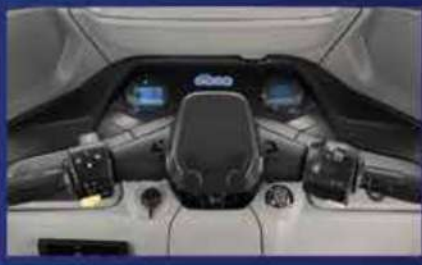
Digital Instrument Cluster (Battery %, Trip Meter, DTE...)