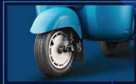
Stylish Wheel Caps