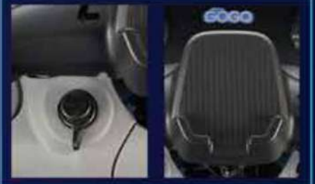
12V AUX socket & Mobile stand