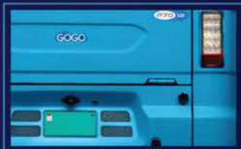
LED Tail Lamps & Number plate lamp