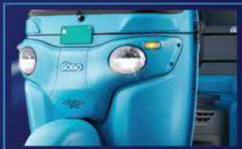
Stylish front fairing, 3 mode LED Headlamps & Blinkers