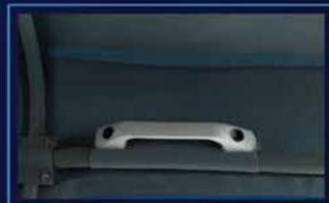
Car-like Monotone interiors & Grab handles