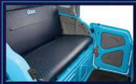
Dual Tone seat with premium upholstery